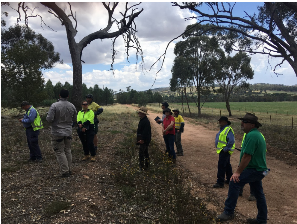
Training for local council staff provided through the Council Roadside Reserves Grant

This project has been assisted by the NSW Government through its Environmental Trust.