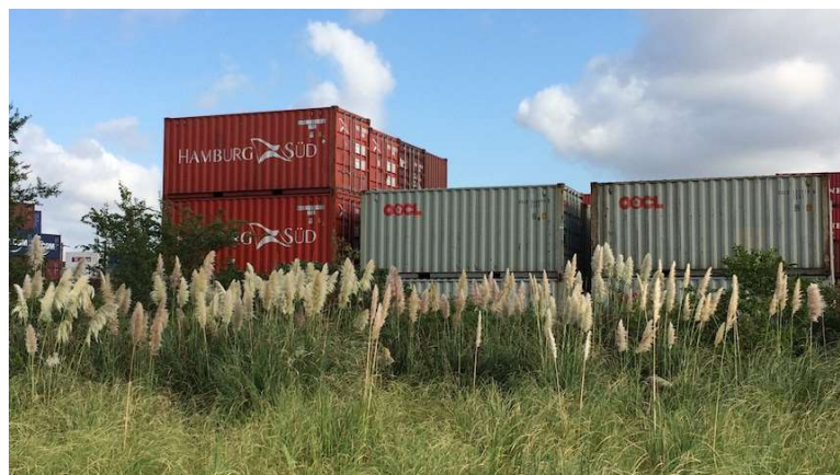
Pampas grass located close to rail lines